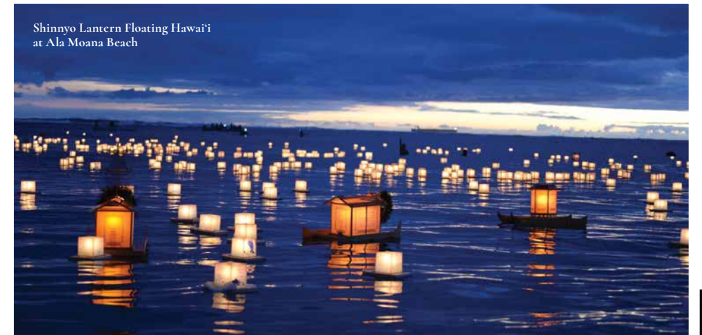
Shinnyo Lantern Floating Hawai'i at Ala Moana Beach

Presented by Halekulani, Hawai'i International Film Festival is the premier showing of contemporary cinema and emerging talents from Asia and the Pacific Islands. Each November the festival presents screenings, educational programs, panels and more, with past guests including Taika Waititi, Elisabeth Moss and Randall Park. hiff.org