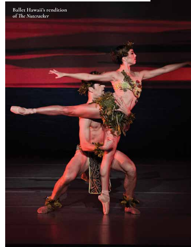
Ballet Hawaii's rendition of The Nutcracker