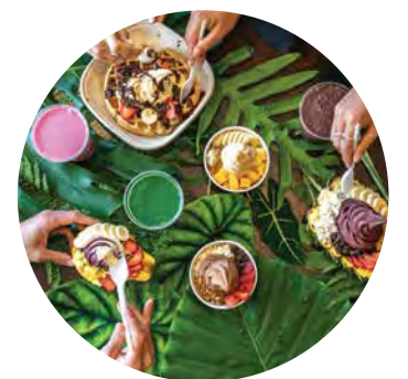
Clockwise from top left: Et al. opened in late 2020; Merriman's new location on O'ahu; Sasanian Osetra caviar from French Japanese restaurant Mugen; Banán serves up frozen blended bananas a la soft serve—with all the yummy toppings.