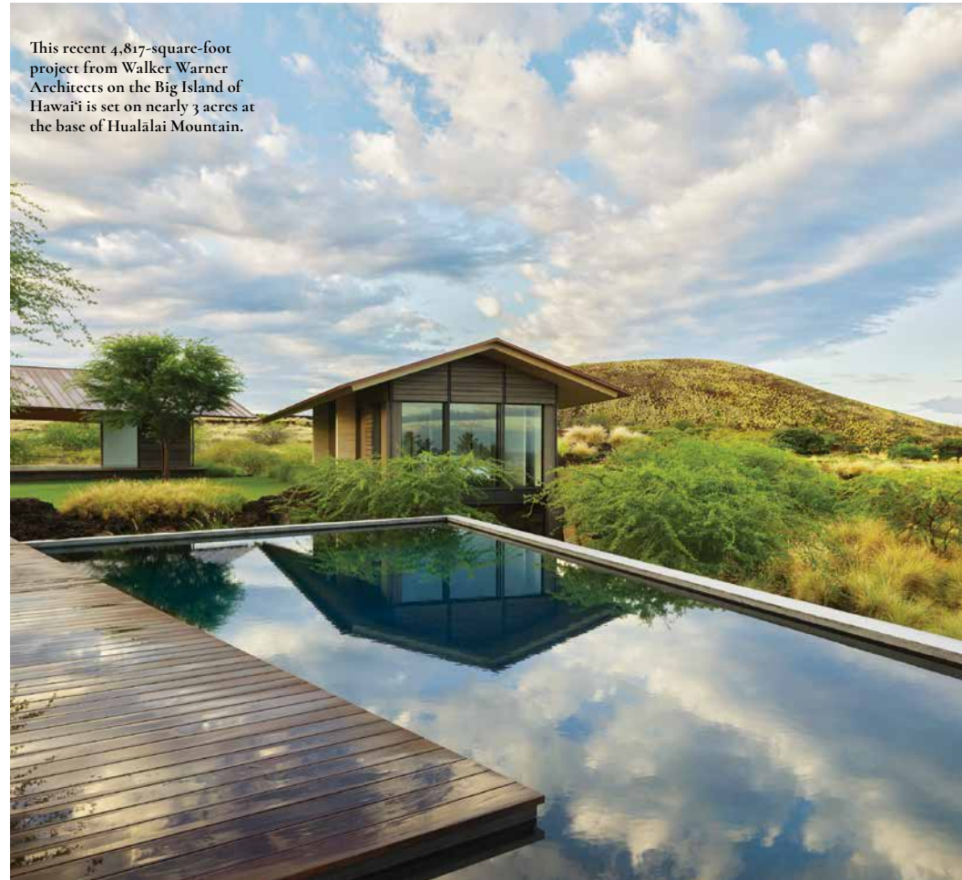
This recent 4,817-square-foot project from Walker Warner Architects on the Big Island of Hawai'i is set on nearly 3 acres at the base of Hualalai Mountain.